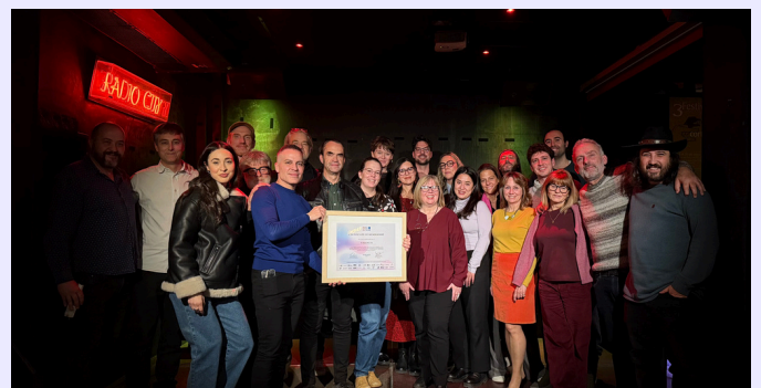
The MCN Members officially welcoming Valencia as member of the Music cities network at the MCN Summit in 2025

MCN connects cities that understand music as a driver of urban development, innovation and inclusion . Within this framework, music is not only an artistic activity, but an essential component of urban life .